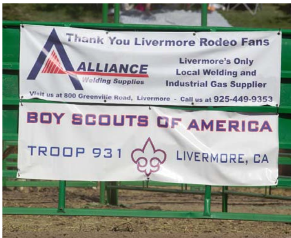
Fence sign: 2'H x 7'W, provided by you