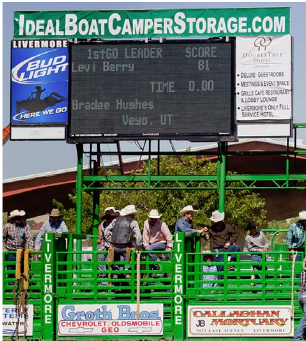
Scoreboard Advertising: Appears in the 7'H x 12'W black area of the scoreboard, shown above, and would be either colored text or your color logo.